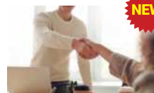
English for Professionals (30+)