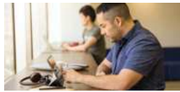
Cambridge English (FCE, CAE, CPE)